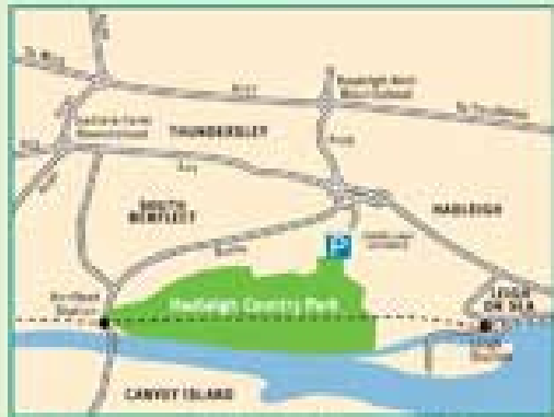
Hadleigh Country Park is jointly owned by Essex County Council and Castle Point Borough Council. The park is managed by Essex County Council's Country Parks Rangers.

Salvation Army Rare Breeds Centre: 01702 558550 www.hadleighfarm.co.uk